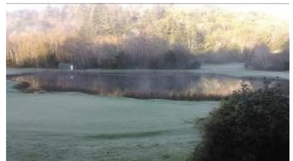
October Frost delay